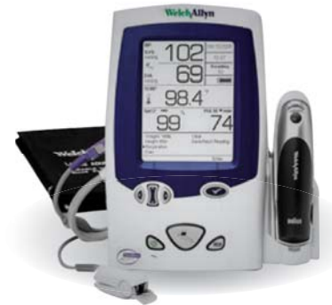
Spot Vital Signs® LXi

Works with your PC or Mac and on most popular video codecs including: